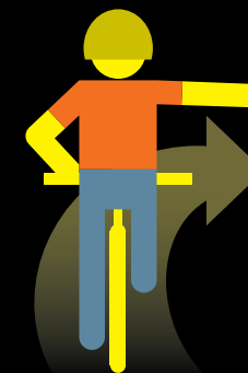
OPTIONAL RIGHT TURN